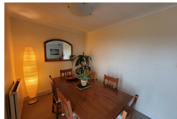
Chelsea Court, Hythe